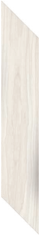
9.4 x 49 cm (4 x 20) SO.SD.LHT.0420.CHEV